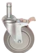
Polyurethane Swivel Caster With Brake