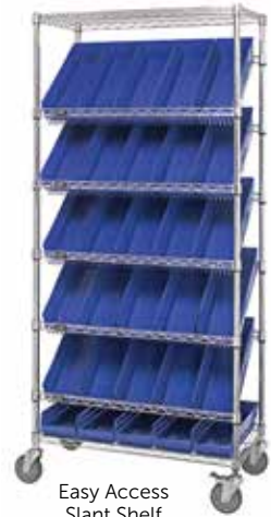
Easy Access Slant Shelf