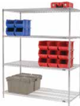
Nexel® Chrome Wire Shelving Starter Unit