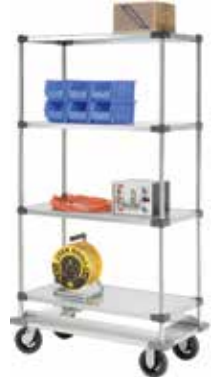
Galvanized Shelf Truck with Dolly Base