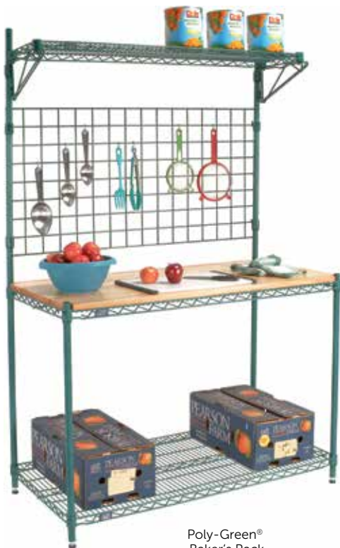
Poly-Green® Baker's Rack

Guests have high expectations when they check-in and it's your responsibility to meet them and try to exceed them. Implementing an efficient organization program helps you accomplish that. Choose shelving and carts that don't just get the task done, they get it done in style.