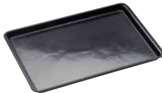
Food Service Tray