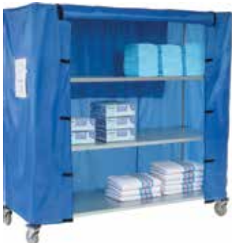
Galvanized Steel Linen Cart with Nylon Cover