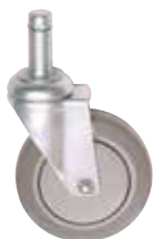
Polyurethane Swivel Caster