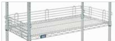
Wire Shelf Ledges

Where you put your shelving and what you need to store is unique to your business and facility, so being able to customize your storage allows you to maximize your shelving investment. From additional shelves & casters to drying racks, dividers, and rolling dolly bases, Nexel® has the accessories you need to make the most of your investment.