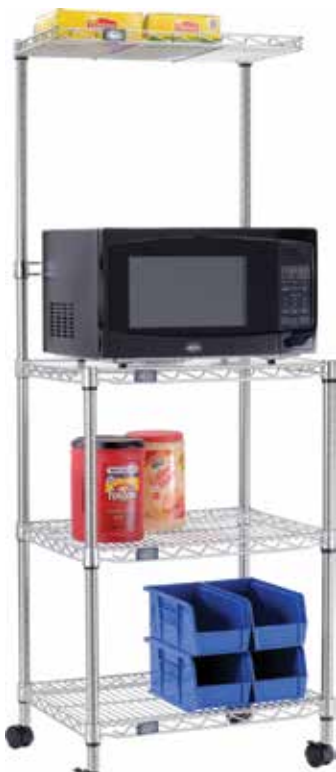
Nexel® Poly-Z-Brite Wire Microwave Cart

A successful business, facility, or institution has to keep pace with technology. Nexel developed solutions including wire computer, laptop, LAN workstations & printer stands that provide room for equipment & peripherals while promoting good airflow and prevent dust from settling on shelf surfaces. Depending on your needs, you can choose mobile or stationary models.