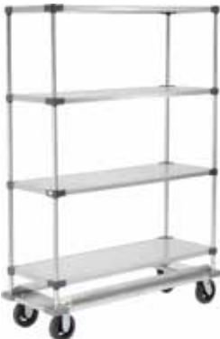
Galvanized Shelf Truck w/Dolly Base

This extremely strong shelving features 1" reinforcement square steel tube rails that provide a heavy-duty weight capacity of 1000 to 1600 pounds per shelf. Shelves easily adjust without tools or disassembly, and align on numbered posts at 1" increments for precise shelf placement that won't waste valuable space.