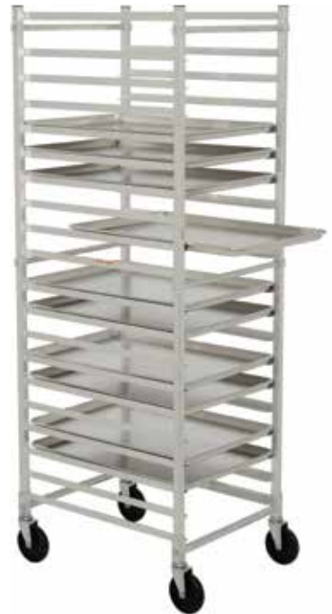
Bakers Sheet Pan Rack