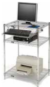
Nexel® Chrome Wire Computer Workstation