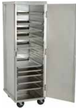
Enclosed Mobile Transport Cabinet