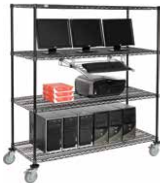
Nexel® 4-Shelf Mobile Wire Computer LAN Workstation

Ideal for microwaves & small appliances like coffee makers or toasters—this rolling mobile cart is at home in kitchens, breakrooms, cafeterias, & other environments. Shelves are fully adjustable to hold stock and supplies like canned goods, cups, utensils, condiments, and more. Its Poly-Z-Brite® finish is designed to handle extreme temperature & moisture, and is protected by the NEXGard® anti-microbial agent.