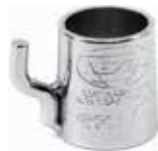
Wire Collar Hook