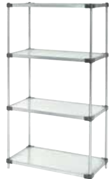
Galvanized Steel Solid Shelving