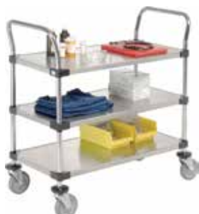
Stainless Steel Utility Cart