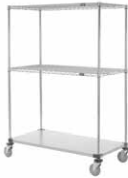
Open Sided Stock Picker Truck