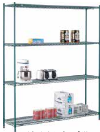
4 Shelf, Poly-Green® Wire Shelving Starter Unit