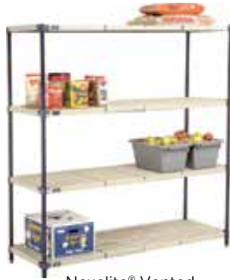
Nexelite® Vented Plastic Mat Shelf