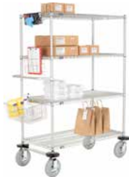
Chrome Curbside Wire Truck