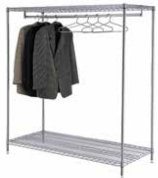
Nexel® Chrome Wire Clothes Rack-2 Shelf