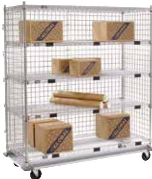
Enclosed Wire Exchange Truck