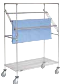
Chrome High Profile Sterile Wrap Rack