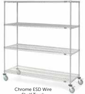
Chrome ESD Wire Shelf Truck