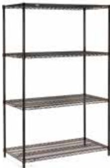
Nexel® Black Epoxy Starter Unit-4 Shelf