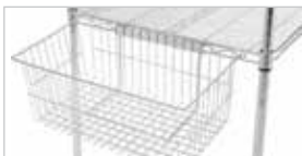
Wire Shelf Basket