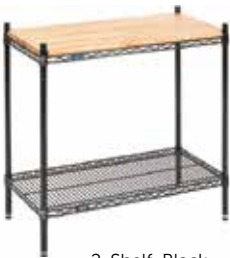
2-Shelf, Black Epoxy Wire Shelving Display Unit

Guests and customers demand & deserve to have their food properly prepared & transported, and Nexel® has the products to help you do that. From shelving units for appliances and ingredients to sheet pan racks, transport cabinets, and even curbside pickup shelf trucks, when you need to get food prepped and served, look to Nexel® for the solution.