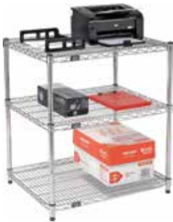
Nexel® Wire Printer Stand-3 Shelf

When you have a building (or buildings) filled with students & staff, having plenty of places to store lunch trays, art supplies, coats, and other school essentials is critical to creating a positive environment that makes learning easier. Choose the wire shelf or cart finish that best meets the specific needs for where you plan on using it to ensure safety and longevity.