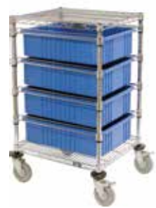
Chrome Wire Cart with (4) 6"H Blue Grid Containers