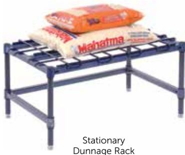
Stationary Dunnage Rack