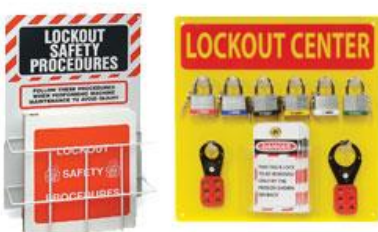
Lockout Centers & Locks