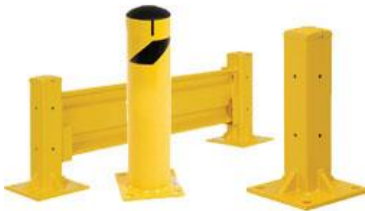
Safety Guards & Crowd Controls