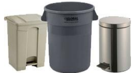
Touchless Garbage Cans