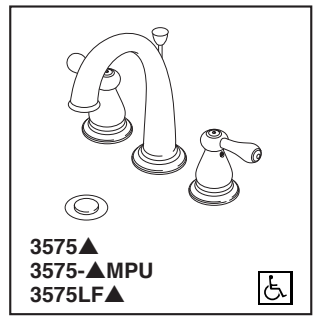
Submitted Model No.: